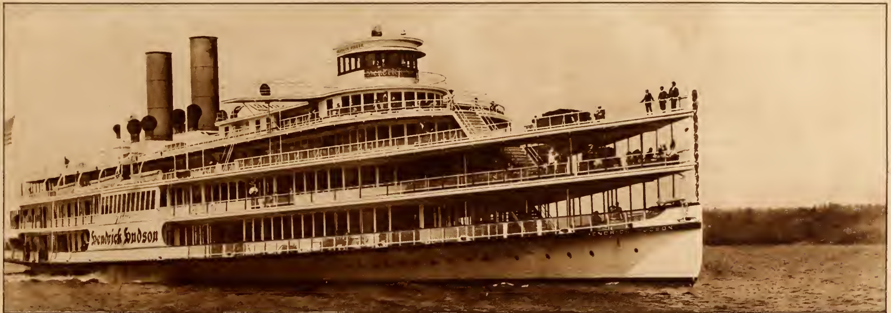
HUDSON RIVER DAY LINE STEAMER "HENDRICK HUDSON." One of the finest river craft. Carries 5,500 passengers. Daily service between New York and Albany.